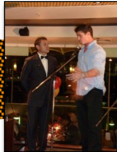
MC for the Gala, Andrew Laming (MP) & Guest speaker Brisbane Lions Captain Jonathan Brown.